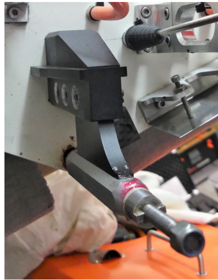
Fig1b Larger version of a strut for 8 mm diameter shafts