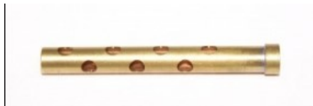
Fig.5 The inner part of a home-made “Speedmaster-style” bearing with a soldered collar

Another type of bearing can be made using a cross-drilled brass tube which fits over the drive shaft. Although the area in contact with the drive shaft is significant, the loading is low and the lubricated area is significantly greater than with bearing bushes. An article in Model Gas Boats describes the method. The only thing to watch is that the arrangement is designed around Imperial tube sizes (see the following web-site https://modelgasboats.com/magazine/how-to-articles-mainmenu-606/328-make-your-own-strut-bushings .) so it may need some modification to work on metric struts 2 .