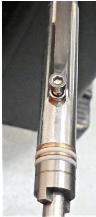
Fig.4 Typical location of the screw used to restraining the drive shaft

adjusted to just extend into the groove, the drive shaft can be effectively retained. Note that using a screw larger than M3 risks the screw losing grip and defeating the safety feature.