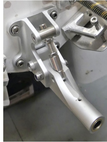
Fig. 2b Stinger with fixed shaft bearings

Some stingers have adjustments that allow their overall length to be changed. The advantage of this feature is that the stinger length can be trimmed to match the precise length of the flexi-shaft which is particularly useful when using a square-drive flexi-shaft.