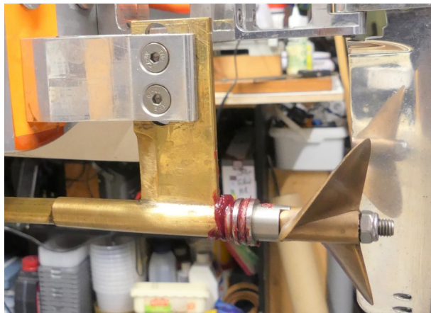
Fig. 1a Conventional strut

A strut is a simple mechanical arrangement in which the flexi-shaft runs in bearings in the body of the strut and this is clamped to angle brackets fixed to the transom via fixing screws. Adjustments to drive height and angle are achieved by loosening the fixing screw(s), setting the relevant parameters – usually with reference to the line of the bottom of the hull – then, of course, by re-tightening the fixing screw(s). Such a strut provides a cheap and mechanically robust solution to mounting the propeller shaft on the transom. As we will see later, a more methodical approach to making adjustments is an advantage, otherwise it is easy go around in circles trying to achieve the intended settings. Nevertheless, once the optimum settings of drive shaft angle and height are achieved the simple strut can offer a very good option rivalling a stinger in many other respects. There are some examples of struts with independent adjustments of height and angle but these tend to be very expensive.