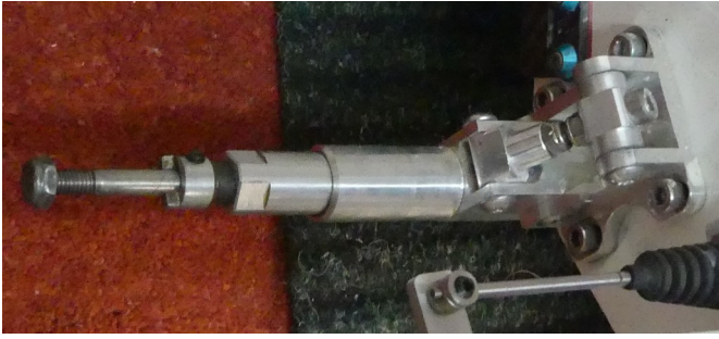
Fig.2a Stinger with removable housing for bearings